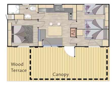
The Venezia - 8.1m long x 3.4m wide

Car parking is available at the end of each row of mobile homes. This allows us to maintain a safer childfriendly environment immediately outside your mobile home.