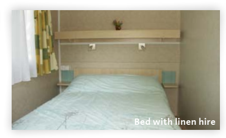
The Murano - 8m long x 3m wide